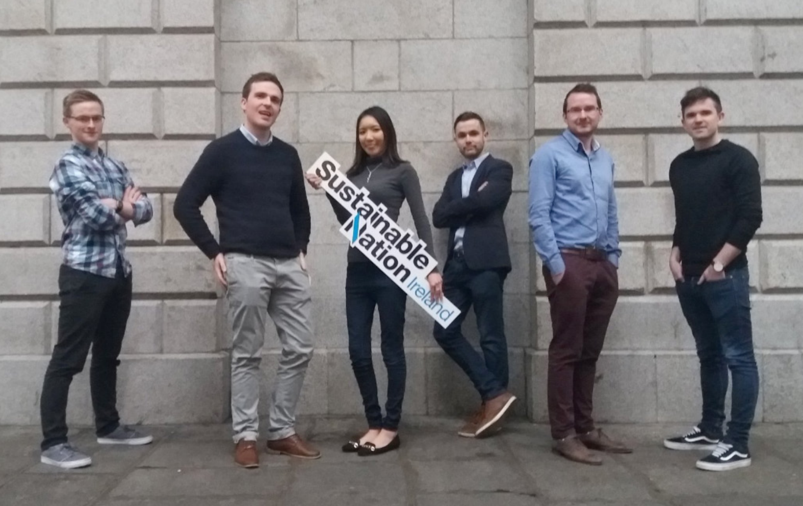
Dublin (above); Tallinn (right)