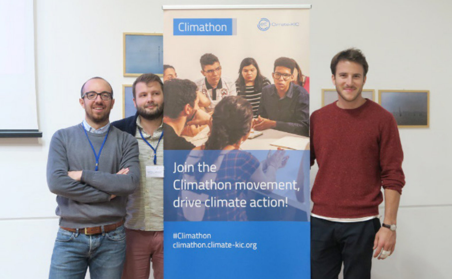
Venice (above); Birmingham (right)