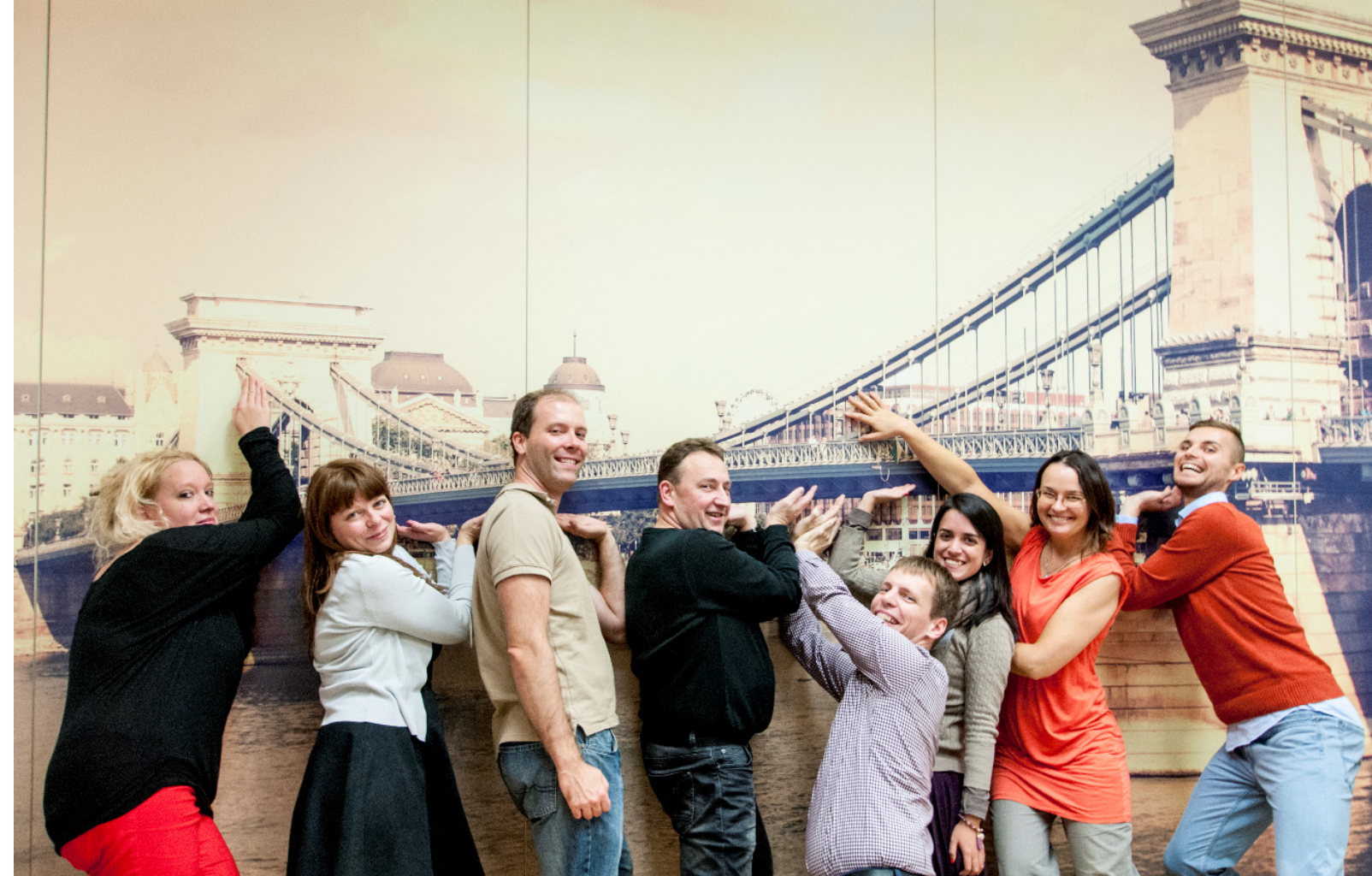
Zurich (below); Budapest (right)

Sometimes, it's hard to know what we can eat to make our diets more climate friendly. However, thanks to Max, it has never been easier. Max is a personal foodie-bot that gives you recommendations on what and where to eat to reduce your carbon footprint, meaning you can save up to 100,000kg of CO2 emissions. Max will even take into account any dietary and allergy requirements, too, as well as sending you seasonal recipes and giving you advice on what to do with your leftovers!