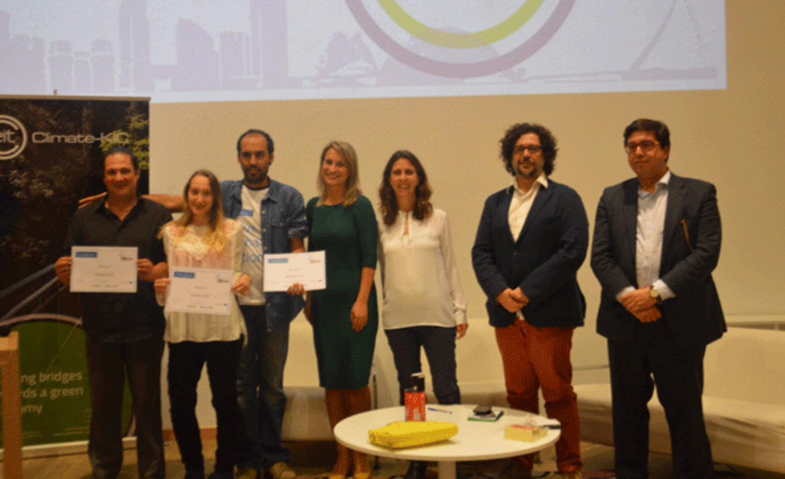
Valencia (above); Vijayawada (right)